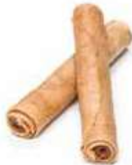
Flautas Rellenas LECHE MILK CHOCOLATE 6 u/bag (approx. 140g) 35 bags/box Ref. FL 25 LSG