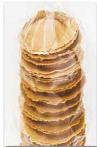
Pamelas 15 u/bag - approx. 145g 20 bags/box Ref. FP