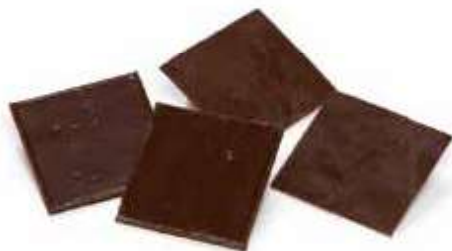
CUADRADO Chocolate negro 30 x 30 mm. 1 Kg/box Ref. CHCU