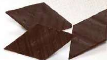
ROMBO Chocolate negro 60 x 30 mm. 3 Kg/box Ref. CHR