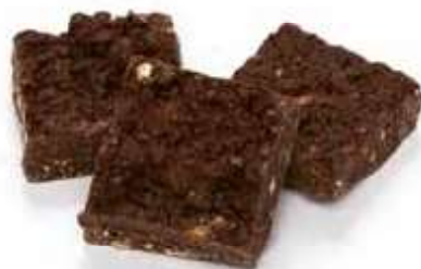
CRUJIENTES 30 x 30 mm. 6,5 Kg/box Ref. CRU