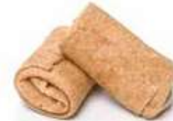
Tronco Relleno AVELLANA HAZELNUT 10 u/bag (approx. 175g) 30 bags/box Ref. TROSG