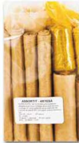
Surtido Artesano 16 u/bag - approx. 225g 16 bags/box Ref. FAAR