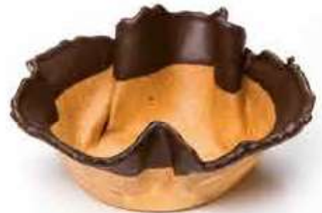
Concha Semi-Bañada 12 cm. ø100 x 45 mm. 90 u/box Ref. FA 90S