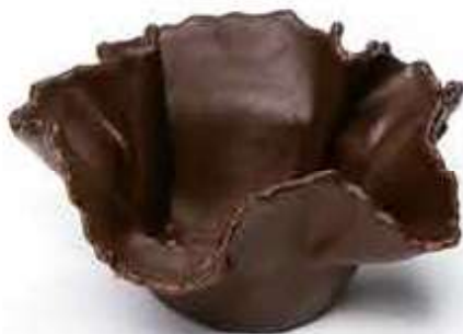
Concha Chocolate 10 cm. ø100 x 45 mm. 112 u/box Ref. FA 10