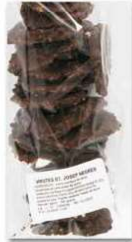
Virutas San José Chocolate negro 200 g/bag 10 bags/box Ref. PTVBO