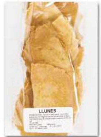
Lunas 15 u/bag - approx. 130g 20 bags/box Ref. LLU15C - clips