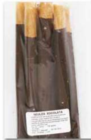
Neules Chocolate 10 u/bag - approx. 120g 27 bags/box Ref. FA30