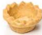
Tartaleta Brisa MINI ø30 x 20 mm. 360 u/box Sweet -Ref. TB6 Salty -Ref. TBS6