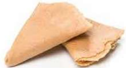
Abanicos 15 u/bag (approx. 130g) 18 bags/box Ref. HE 20SS

Any product from the biscuit section can be produced sugar-free. For more information, please contact us.