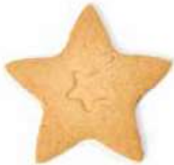
Estrellas Brisa ø 90mm 1 Kg/box Sweet -Ref. ESD Salty -Ref. ES