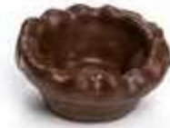
Tartaleta MINI CHOCOLATE ø31 x 21 mm. 360 u/box Sweet -Ref. TBCHO