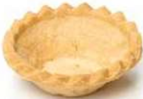
Tartaleta Brisa MEDIANA ø45 x 15 mm. 90 u/box Sweet -Ref. TB4 Salty -Ref. TBS4