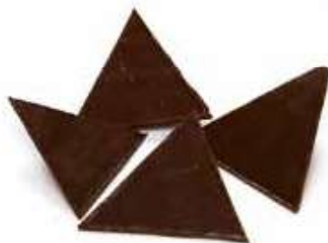
TRIÁNGULO Chocolate negro 50 x 50 mm. 1 Kg/box Ref. CHT