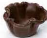
Mini Concha Chocolate 4 cm ø40 x 20 mm. 300 u/box Ref. FA 300