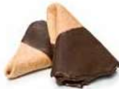
Abanicos Chocolate 15 u/bag (approx. 150g) 18 bags/box Ref. FA 20ASG