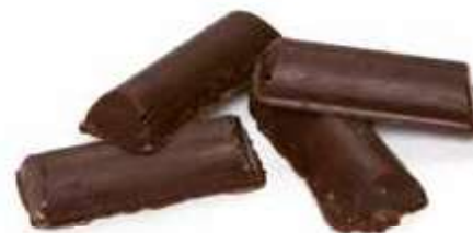
Barrita Mini Chocolate negro 40 mm. 8 Kg/box Ref. CHMI