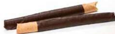
Neules Chocolate 15 u/bag (approx. 220g) 30 bags/box Ref. FA 35SG