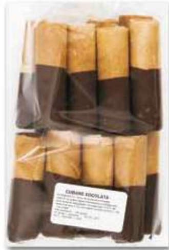
Cubanos Chocolate 16 u/bag - approx. 195g 18 bags/box Ref. FA18G