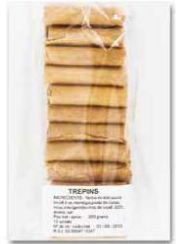
Trepins 12 u/bag - approx. 200g 25 bags/box Ref. TRE