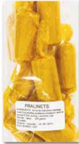
Pralinets 10 u/bag - approx. 205g 25 bags/box Ref. MAPB