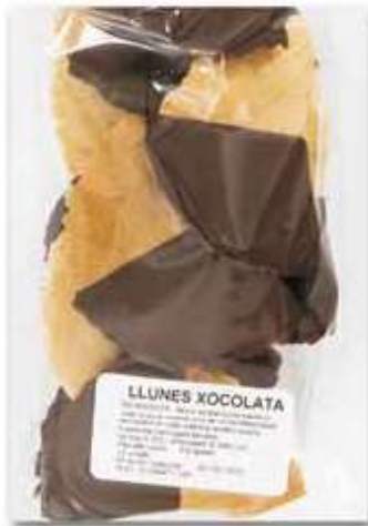
Lunas Chocolate Negro 12 u/bag - approx. 150g 20 bags/box Ref. LLUXB