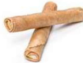
Flautas Rellenas BLANCO WHITE CHOCOLATE 6 u/bag (approx. 140g) 35 bags/box Ref. FL 25 BSG