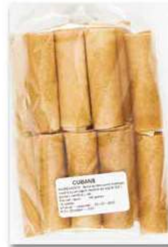
Cubanos 16 u/bag - approx. 140g 18 bags/box Ref. HE18