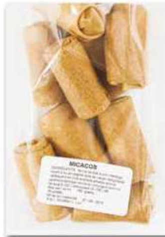
Micacos 10 u/bag - approx. 180g 30 bags/box Ref. Mi-1