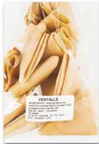
Abanicos 15 u/bag - approx. 130g 18 bags/box Ref. HE20