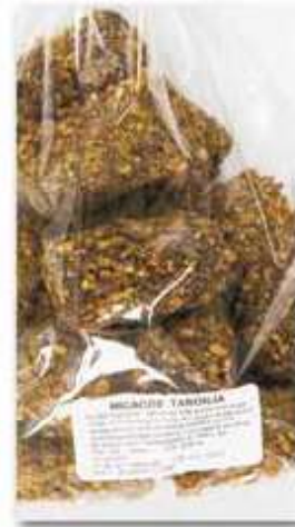
Micacos Naranja 10 u/bag - approx. 270g 24 bags/box Ref. MICAC