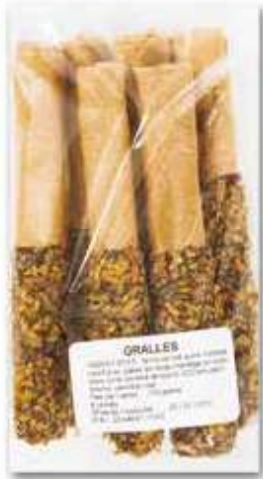
Gralles 6 u/bag - approx. 150g 30 bags/box Ref. RA