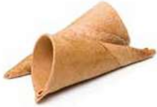
Conos helado 6 u/bag (approx. 95g) 10 bags/box Ref. HE40SG