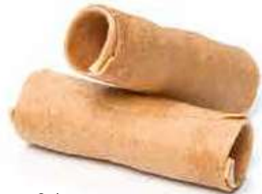
Cubanos 16 u/bag (approx. 140g) 18 bags/box Ref. HE 18SSN