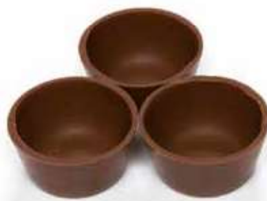
Petitfours LECHE ø 35 x 20 mm. 612 u/box Ref. PTLC