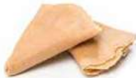
Abanicos 15 u/bag (approx. 110g) 18 bags/box Ref. HE 20SG