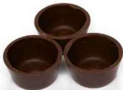
Petitfours NEGRO ø 35 x 20 mm. 612 u/box Ref. PTNC