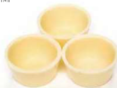
Petitfours BLANCO ø 35 x 20 mm. 612 u/box Ref. PTB

Any product from this range can be tailor-made according your needs. For more information, please contact us.