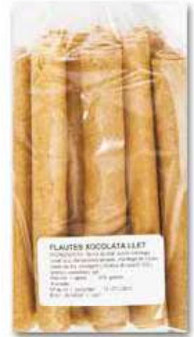
Flautas Chocolate con leche 9 u/bag - approx. 210g 25 bags/box Ref. FL25