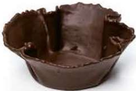
Conchas Chocolate 12 cm. ø120 x 45 mm. 96 u/box Ref. FA 40