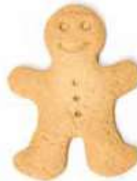
Muñecos Brisa 80 x 107 mm. 2,5 Kg/box Sweet -Ref. MUÑE Salty -Ref. MUÑES