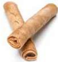
Flautas Rellenas NEGRO DARK CHOCOLATE 6 u/bag (approx. 140g) 35 bags/box Ref. FL 25 SG6