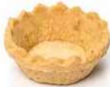
Tartaleta Brisa PEQUEÑA ø40 x 15 mm. 360 u/box Sweet -Ref. TB5 Salty -Ref. TBS5