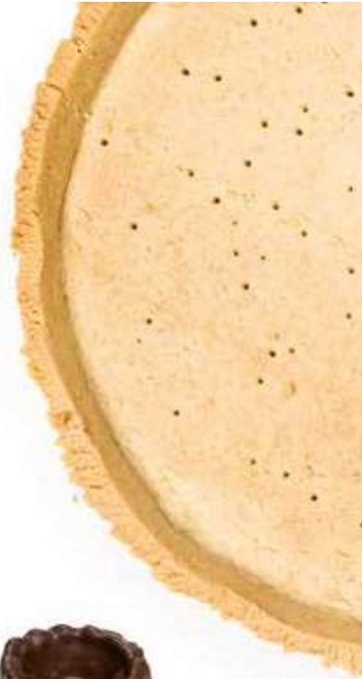
Tartaleta Brisa GIGANTE ø260 x 20 mm. 5 u/box Sweet -Ref. TB1 Salty -Ref. TBS1