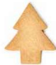
Árboles Brisa 70 x 80 mm. 1 Kg/box Sweet -Ref. ARD Salty -Ref. AR