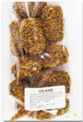
Co-Kiss 10 u/bag - approx. 250g 30 bags/box Ref. CC2