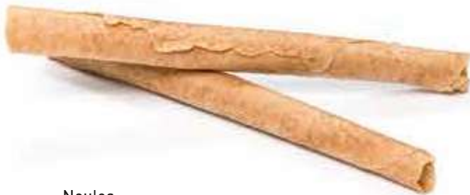
Neules 25 u/bag (approx. 130g) 40 bags/box Ref. HEN 30