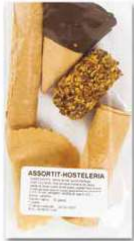
Surtido Hosteleria 5 u/bag - approx. 70g 40 bags/box Ref. FA5