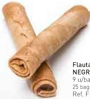
Flautas Rellenas NEGRO 9 u/bag (approx. 190g) 25 bags/box Ref. FLSS