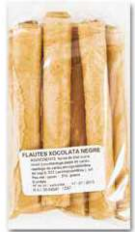
Flautas Chocolate negro 9 u/bag - approx. 210g 25 bags/box Ref. FL25v