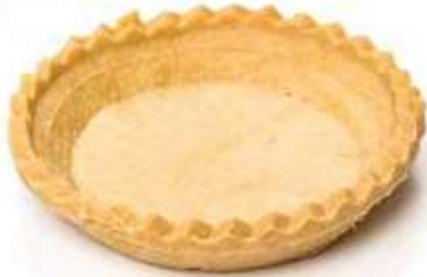
Tartaleta Brisa GRANDE ø95 x 16 mm. 77 u/box Sweet -Ref. TB2 Salty -Ref. TBS2