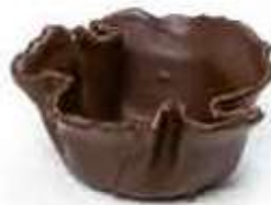
Conchas Chocolate 6 cm. ø60 x 25 mm 140 u/box Ref. FA 6