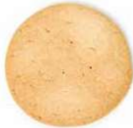
Discos Brisa ø100mm. 104 u/box Sweet -Ref. DI Salty -Ref. DIS