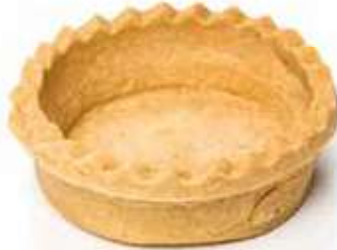
Tartaleta Brisa Super Mediana ø75 x 20 mm. 90 u/box Sweet -Ref. TB3 Salty -Ref. TBS3