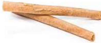
Neules 20 u/bag (approx. 160g) 24 bags/box Ref. HEN 29