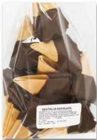
Abanicos Chocolate 15 u/bag - approx. 175g 18 bags/box Ref. FA20A