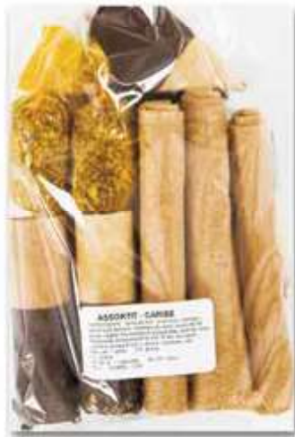
Surtido Caribe 16 u/bag - approx. 275g 16 bags/box Ref. FA16